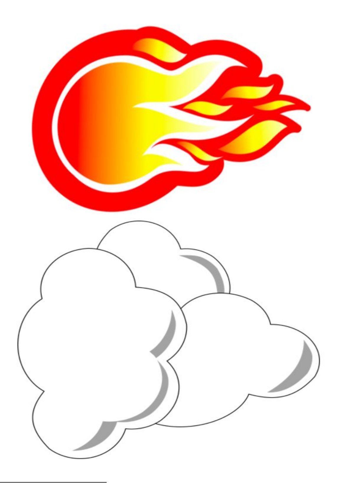
Handout 1: Pillar of Cloud and Fire<sup>2</sup>